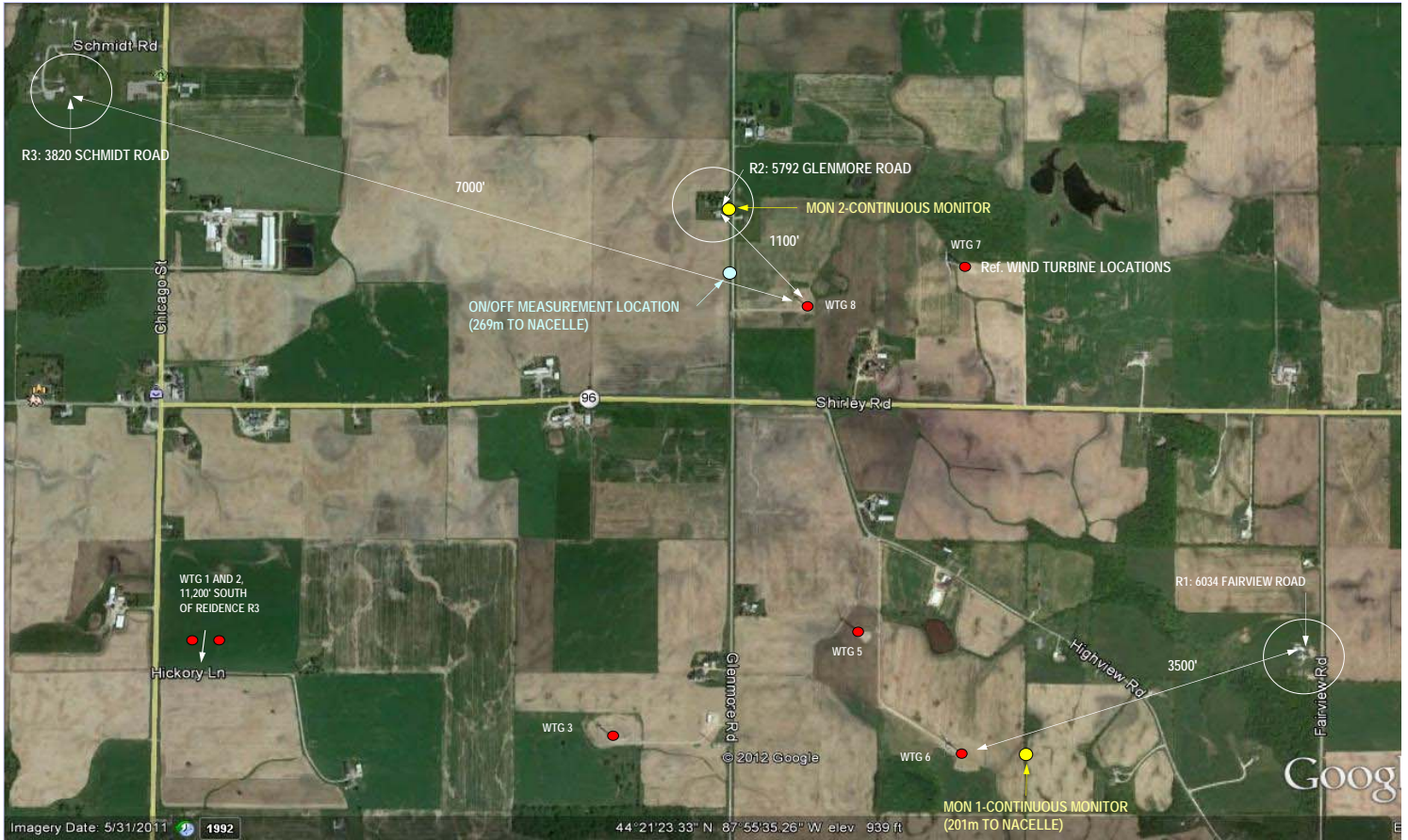
Figure 2.1: Aerial view showing sound survey locations

The four firms wish to thank and acknowledge the extraordinary cooperation given to us by the residence owners and various attorneys.